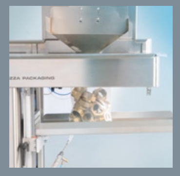
Heavy product support