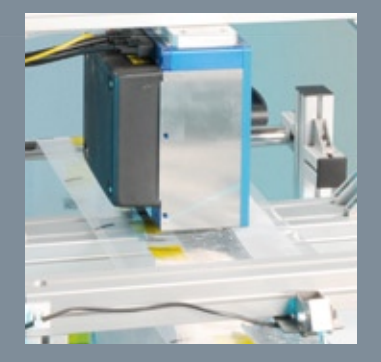
Thermal transfer printers