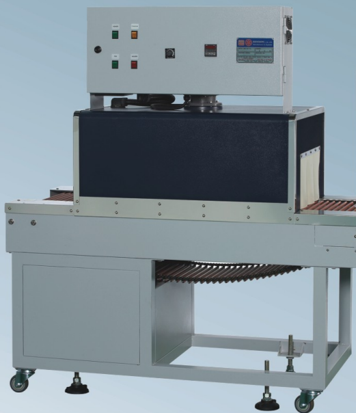
DS-400 HEAT TUNNEL