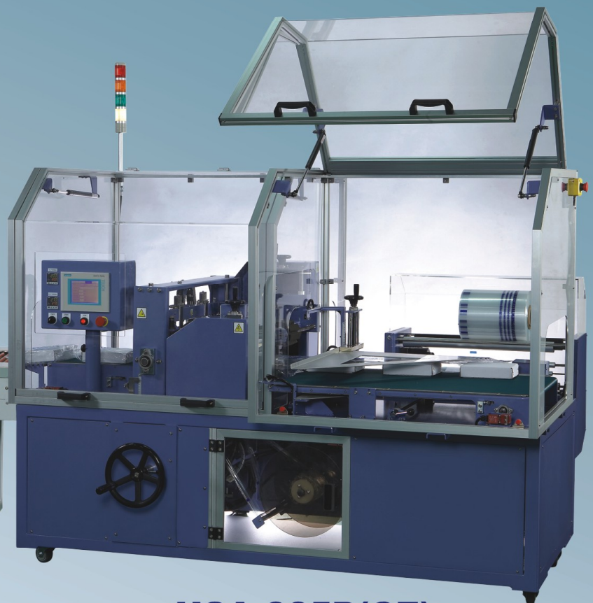
USA-005P(CE) AUTO. SIDE-SEAL MACHINE